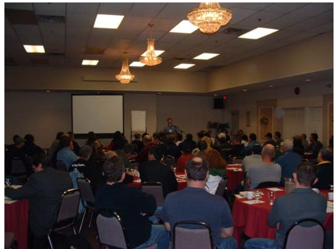
Western Fallers AGM, 2006, Nanaimo, BC